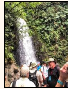
Waterfall in Costa Rica

On the ship, I sunbathed, relaxed and saw lots of shows. On a smaller boat, we went whale watching and saw a very large whale. At a fishing village, we saw wild sea lions. The fisherman gave them scraps after cleaning the fish. The sea lions took rides on the back of the boat! In Costa Rica we saw beautiful waterfalls.