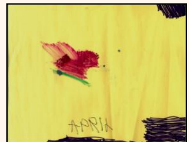
Spring by April