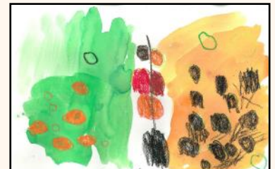
Butterfly by April