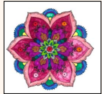
Flower by Brittany