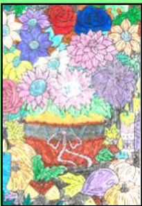
Spring Bouquet by Britany