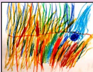
Fire by April