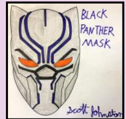
Black Panther Mask by Scott