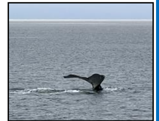
Whales in Ketchikan

The meals on the ship offered delicious seafood. Lots of fish dishes especially sea scallops. Alaska felt like a safe state. All the people were very friendly and kind. The locals in port were welcoming. Michelle said: "This trip was spectacular - so much beauty to see! One of the wonders of the world."