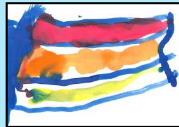
Flag by Matt